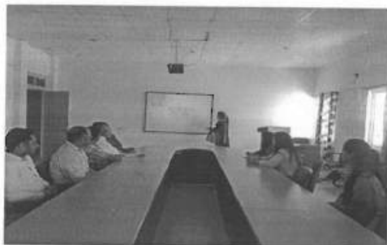
Non teaching staff attending the lecture on code of conduct policy