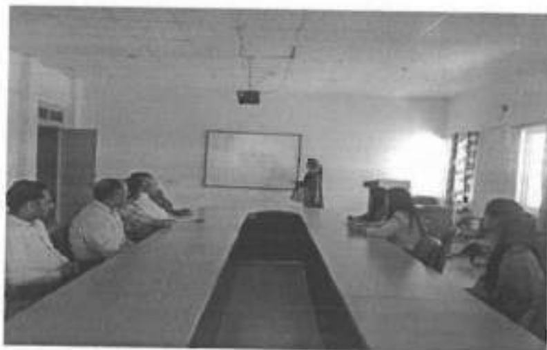
Non teaching staff attending the lecture on code of conduct policy