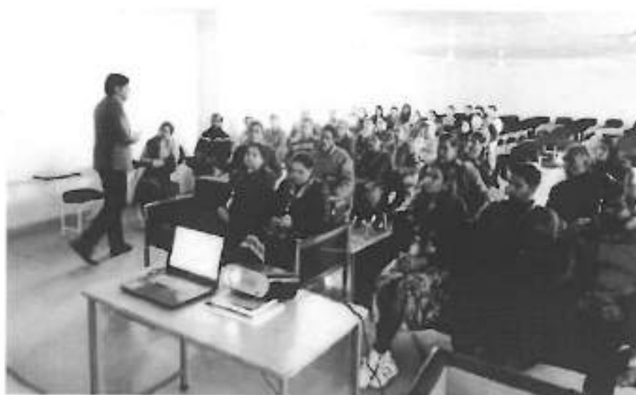
Non teaching staff attending the lecture on laws, regulation and code of conduct policy