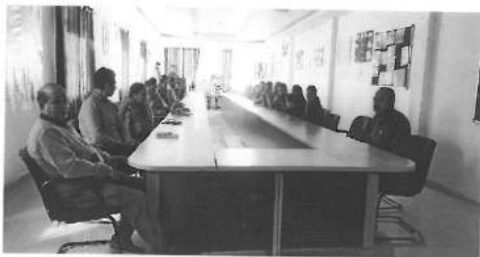
Faculties attending the lecture on laws, regulation and code of conduct