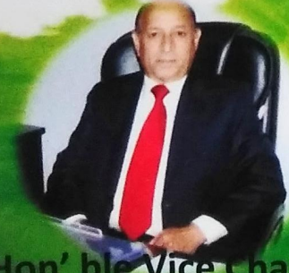
Hon' ble Vice Chancellor