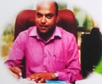
Hon'ble Pro Chancellor