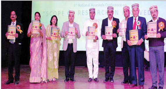
'स्कोप ऑफ रिसर्च इन आयुर्वेद' विषय पर शोध पत्रों के साथ तोषायाँ।