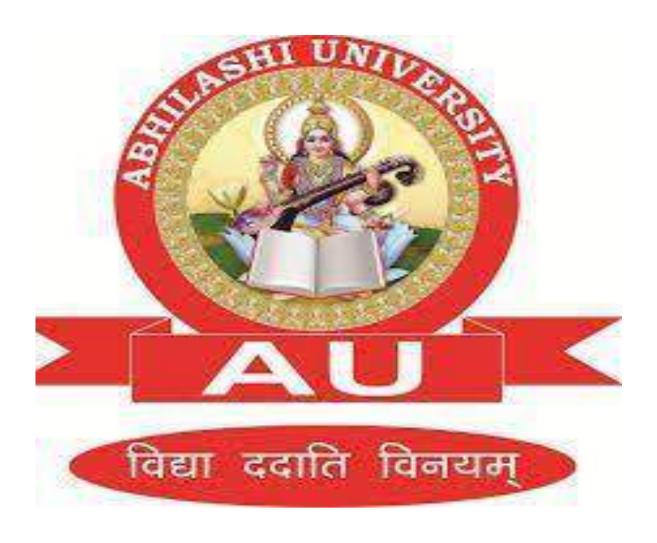
Masters of Business Administration Course Outcome