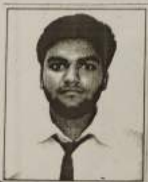
Photo of Student