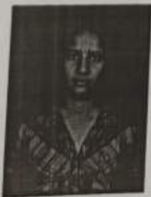
Photo of Student