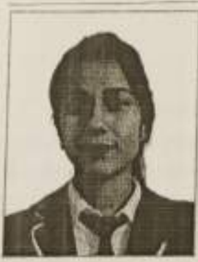
Photo of Student