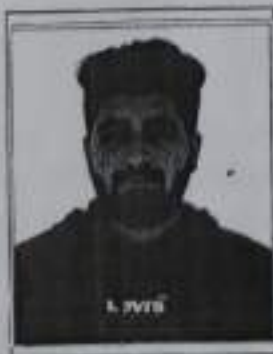
Photo of Student