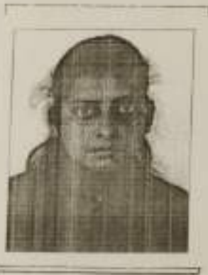
Photo of Student