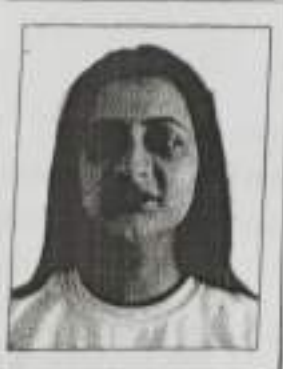
Photo of Student