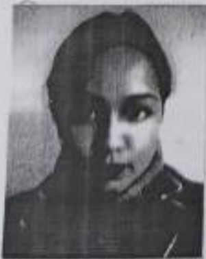
Photo of Student