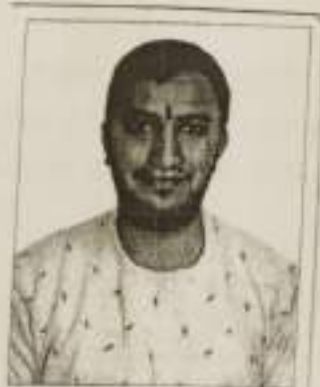
Photo of Student