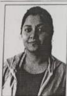
Photo of Student