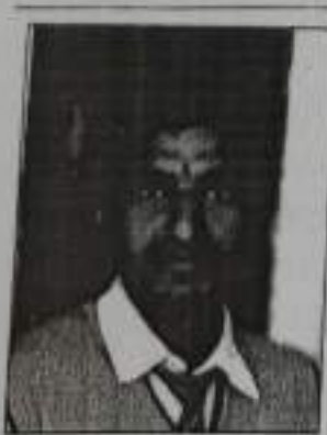
Photo of Student