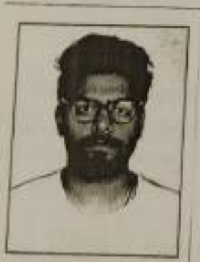
Photo of Student