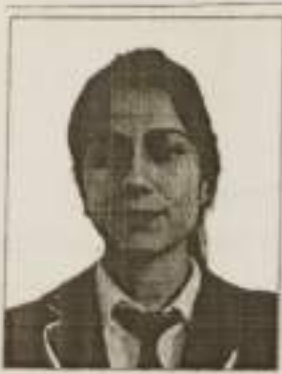
Photo of Student