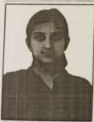
Photo of Student