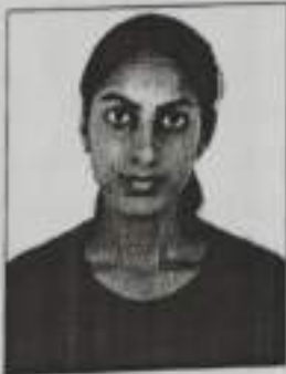
Photo of Student