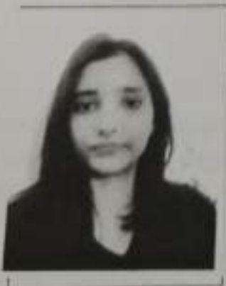
Photo of Student