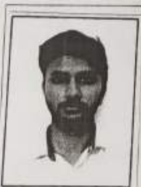
Photo of Student