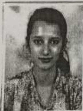
Photo of Student