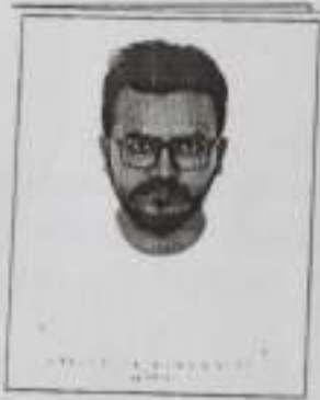
Photo of Student