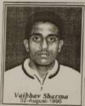
Photo of Student